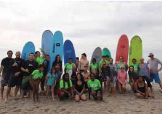
Summer outreach of New City Fellowship in Atlantic City

says. "I love being a part of it." Even though getting the word out is challenging, the Lord has brought visitors nearly every week.